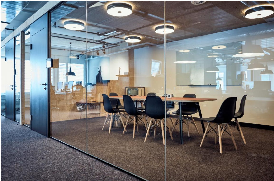
Westhive Meeting Rooms