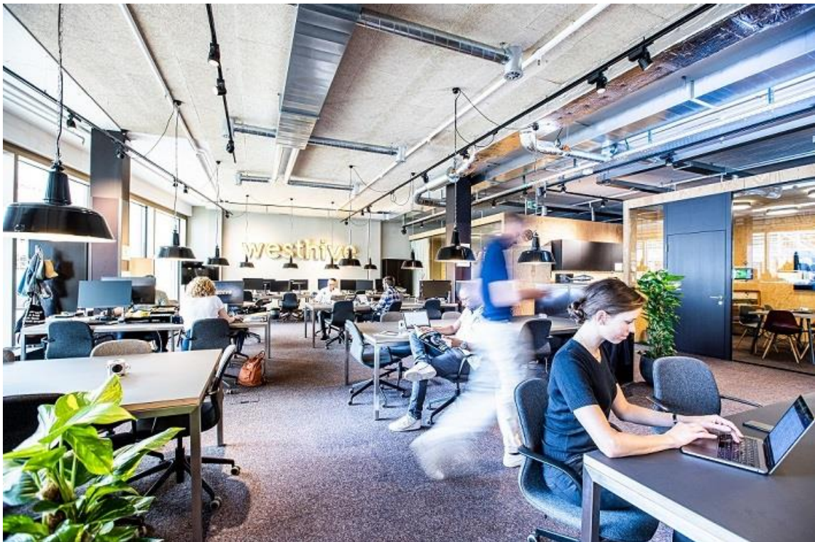
Westhive Open Space