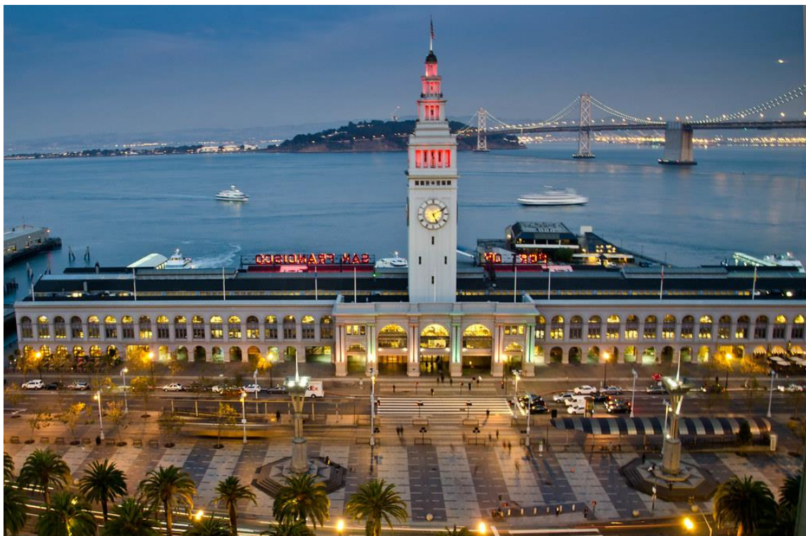
San Francisco Ferry Building

You have also received all pictures as separate image files.